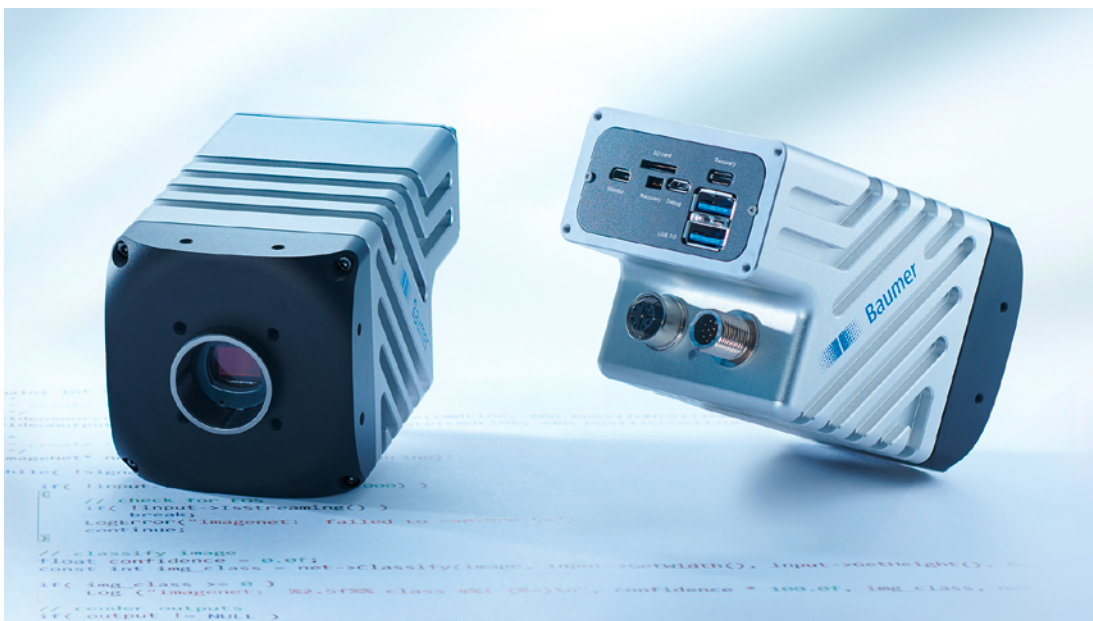
Fig. 1: The freely programmable AX Smart Cameras combine robust industrial-grade camera technology, market-leading NVIDIA® Jetson™ AI modules, and high-performance Sony® CMOS sensors to create a freely programmable image processing platform.

The market for AI in image processing will continue to grow. This should not surprise anyone – image processing with its complex image data lends itself particularly well to the use of AI-based algorithms. This is supported by the available and easy-to-use Software Development Kits (SDKs) such as TensorFlow and Caffe. AI models specially trained for use cases that perform tasks such as bulk material monitoring or object position recognition in image processing applications