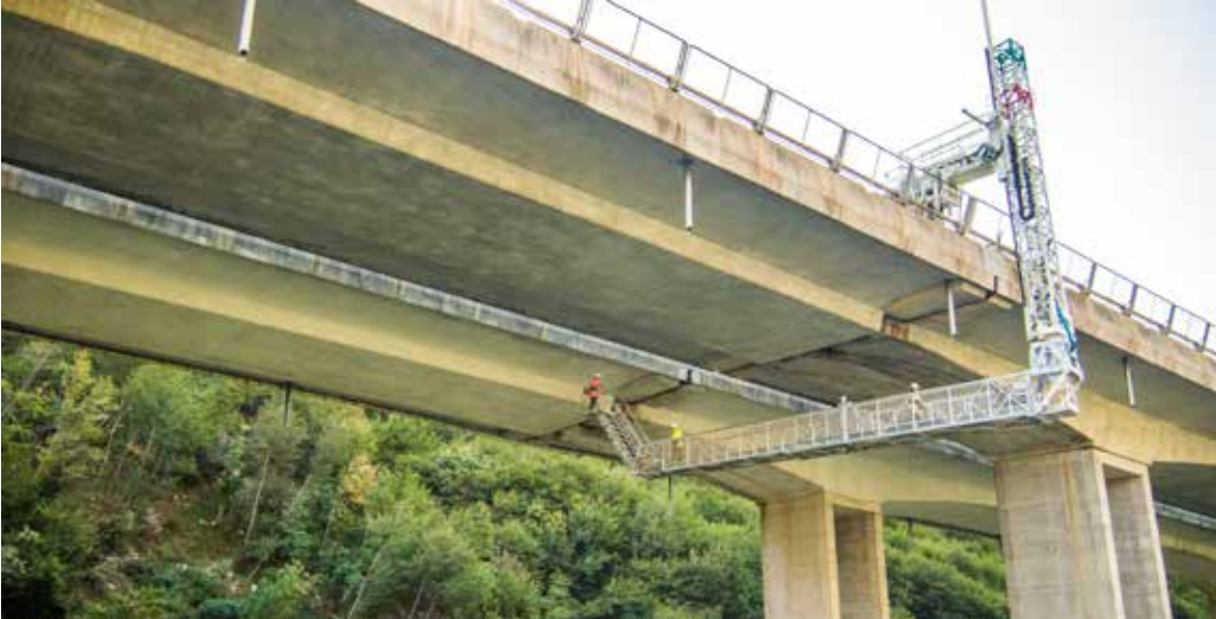
Figure 2: Thanks to very robust and reliable Baumer sensors the functioning of bridge inspection vehicles is always guaranteed, as with this check on the Italian A27 highway viaduct.

BARIN in the Veneto city of Cittadella (Italy) therefore relies on solutions from international sensor specialist Baumer. Under the name "Designed for Mobile Machines" Baumer offers its customers a broad portfolio of innovative sensor solutions customized for different requirements.