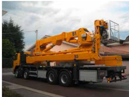
Figure 5: Fully equipped with first class components for maximum safety. BARIN's AB235L with Baumer bearingless encoders is ready for bridge inspection all around the globe. Dust, humidity, saltiness and other factors have no influence on this design.

The following also applies to other Baumer sensors, such as the inclination sensor GIM140R and GIM500R or the cable transducer GCA3 in BARIN's MEWPs: "The Baumer team understands our needs and always has the ideal solution ready or is willing to develop it," says Marco Spagnuolo. "Since the beginning of our cooperation, there have been several situations where we