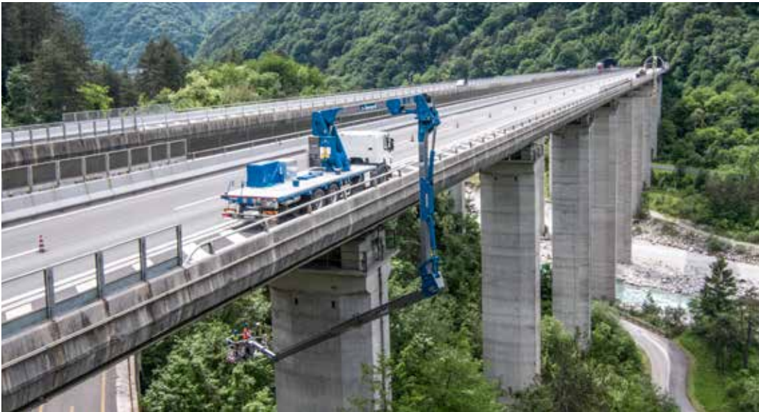
Figure1: Safety first: Mobile machines for bridge inspection need to work under all circumstances. This picture shows viaduct inspection on the A23 highway in Italy with BARIN's AB20S.

Reliability, intelligence and data security even in harsh environmental conditions: these are the requirements that mobile machine components must meet. This is also true for Italian machine manufacturer BARIN, which produces mobile work platforms for bridge inspection and maintenance. For this, the company relies on innovative sensor solutions from longtime partner Baumer. Designed specifically to meet customer requirements, they significantly increase safety, performance and productivity.